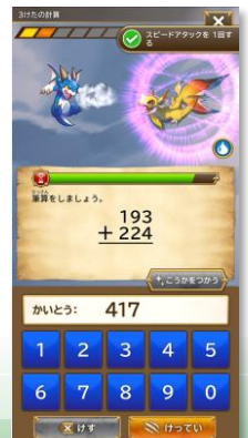
Gakken's famous app leads children to learn math in a game-like manner. →